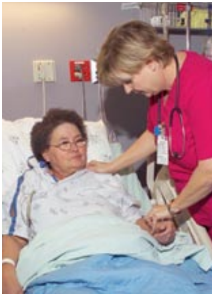
Every day of the year, nurses at Colorado Plains Medical Center go above and beyond to bring comfort to patients.

May is National Nurses week, and we at Colorado Plains Medical Center want to show our appreciation for the men and women who are the backbone of patient care.