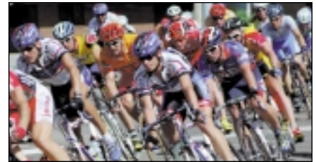
Annual Bicycle Criterium at the Festival in the Park

higher education. The school system receives support from the 45,000-volume public library and the Fort Morgan Museum, which recently underwent a $2 million expansion. Morgan County is also home to the Tin Man Triathlon, the Glenn Miller Festival (the world-famous Big Band musician grew up here) and the world’s largest open rodeo.