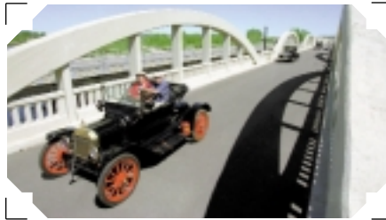
Recently restored Rainbow Bridge is a local landmark, listed on the National Register of Historic Places.

College is a two-year community college, one of 14 community colleges in the Colorado Community College & Occupational Education System, Colorado’s largest system of